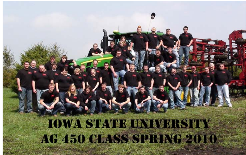
IOWA STATE UNIVERSITY AG 450 CLASS SPRING 2010

Iowa State University does not discriminate on the basis of race, color, age, religion, national origin, sexual orientation, sex, marital status, disability or status of a U.S. Vietnam Era Veteran. Any persons having inquiries concerning this may contact the Director of Affirmative Action, 318 Beardshear Hall, (515) 294-7612